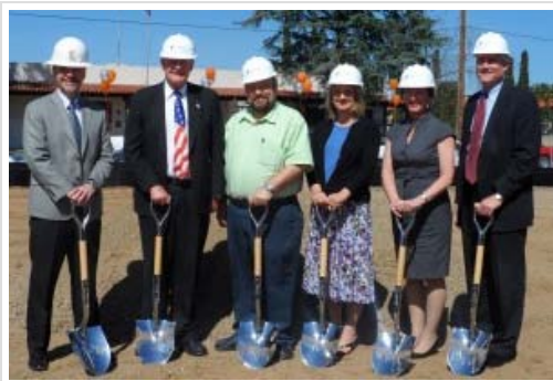
El Cajon city officials and JP Morgan/Chase Bank representatives at Soterra groundbreaking ceremony.

APRIL 11, 2012 BY SDCNEWS LEAVE A COMMENT